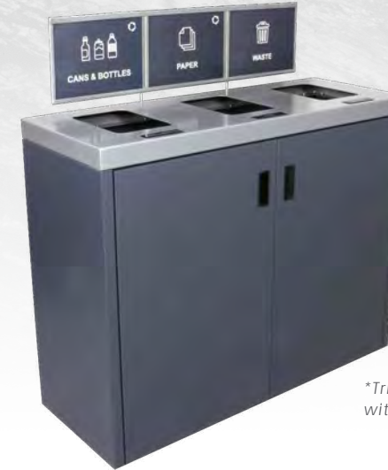
*Triple shown with signframe